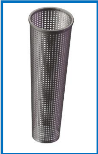
Remove Existing Basket