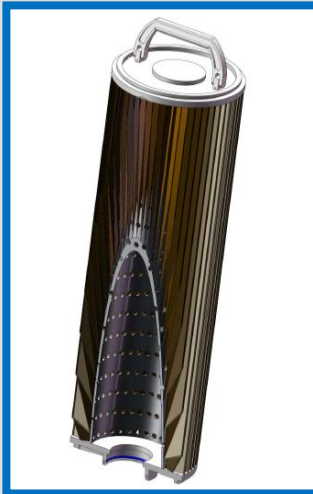
Install MAX-OUT Cartridge